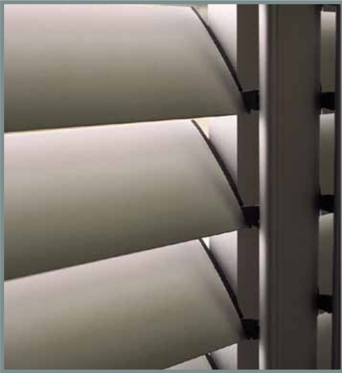
A unique swivel designed side-mounted tilt bar guarantees smooth responsive control.