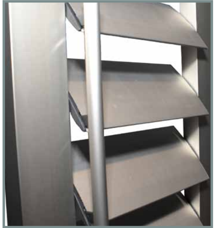
Ergonomically designed to create refined lines with a light-omitting fit.