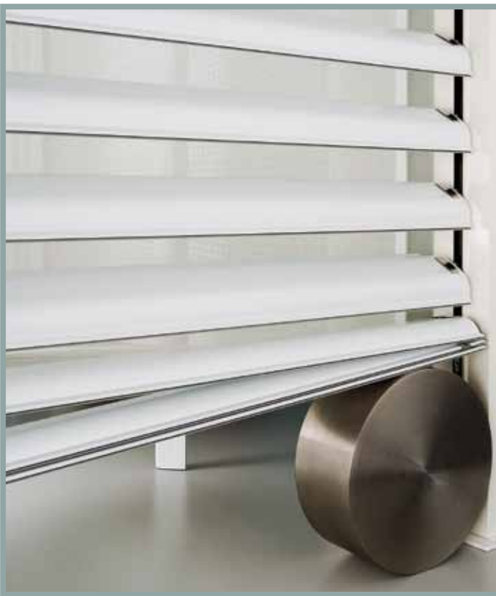
Self adjusting system prevents jamming