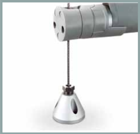
Custom floor attachment