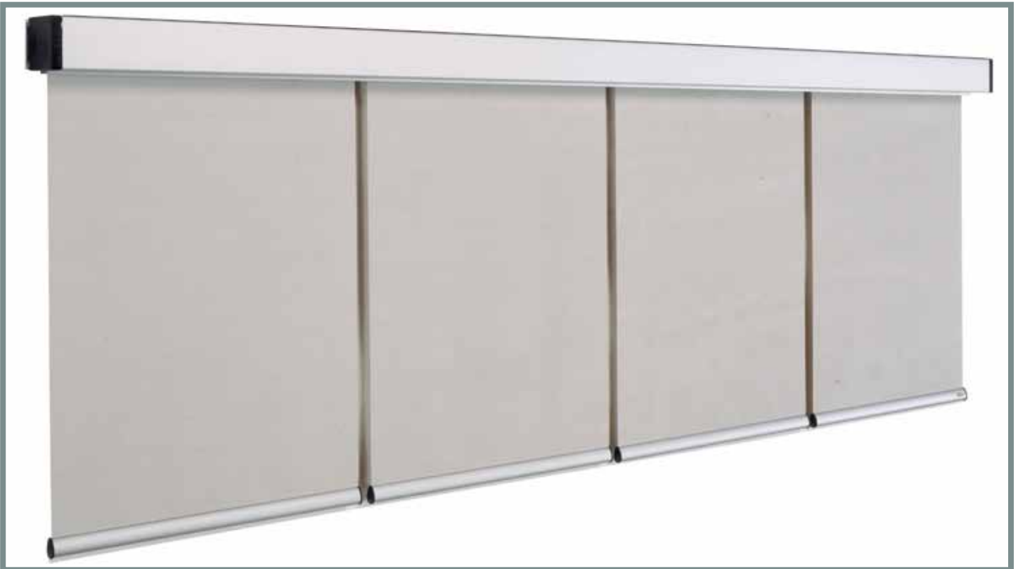
Moduline tandem. One control operates up to 4 shade bands