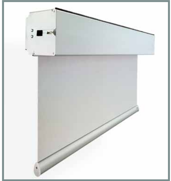
Moduline 140. Available with motor only