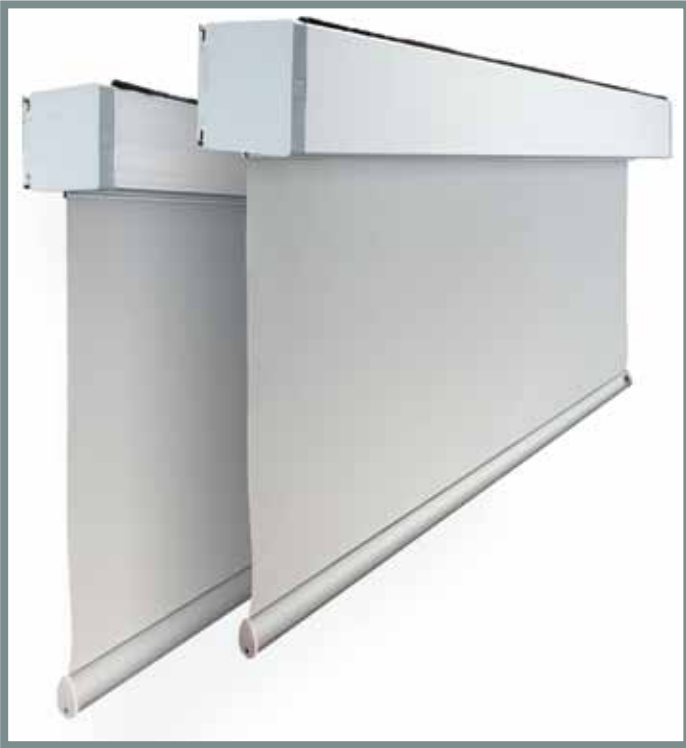
Moduline 85 & 105. Available with Lite-Lift or motor