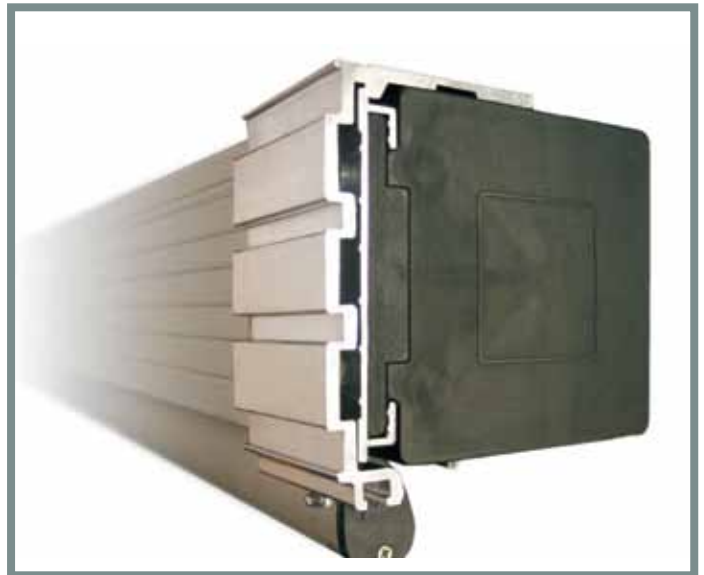
Shade holder for 85/105 bracket