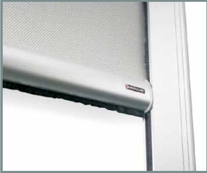
Room darkening channel system