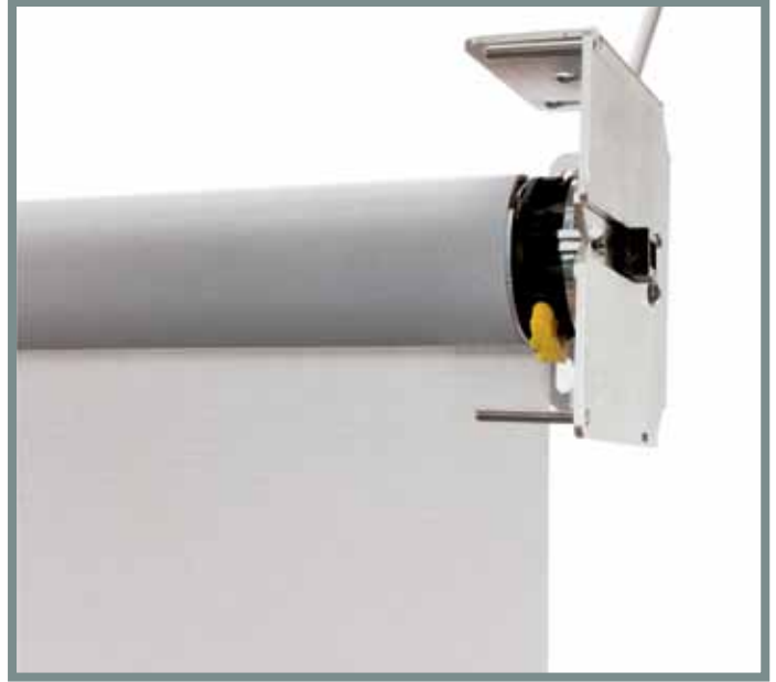
MODULINE ELEKTRA motor operated system