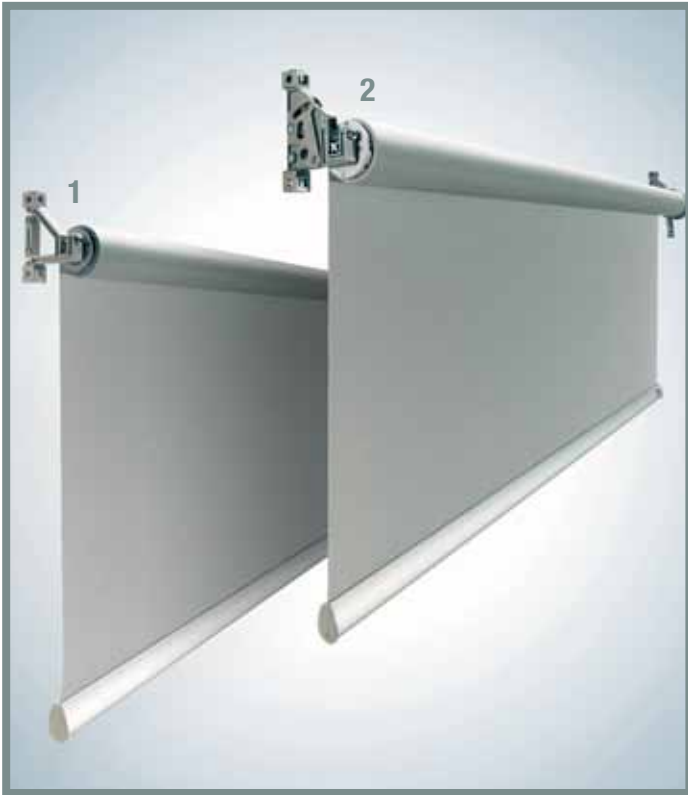
1. Tekno Open Roll with TR bracket 2. Tekno Open Roll with HP bracket