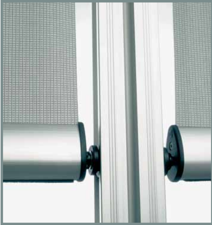
Tekno with T3 channel