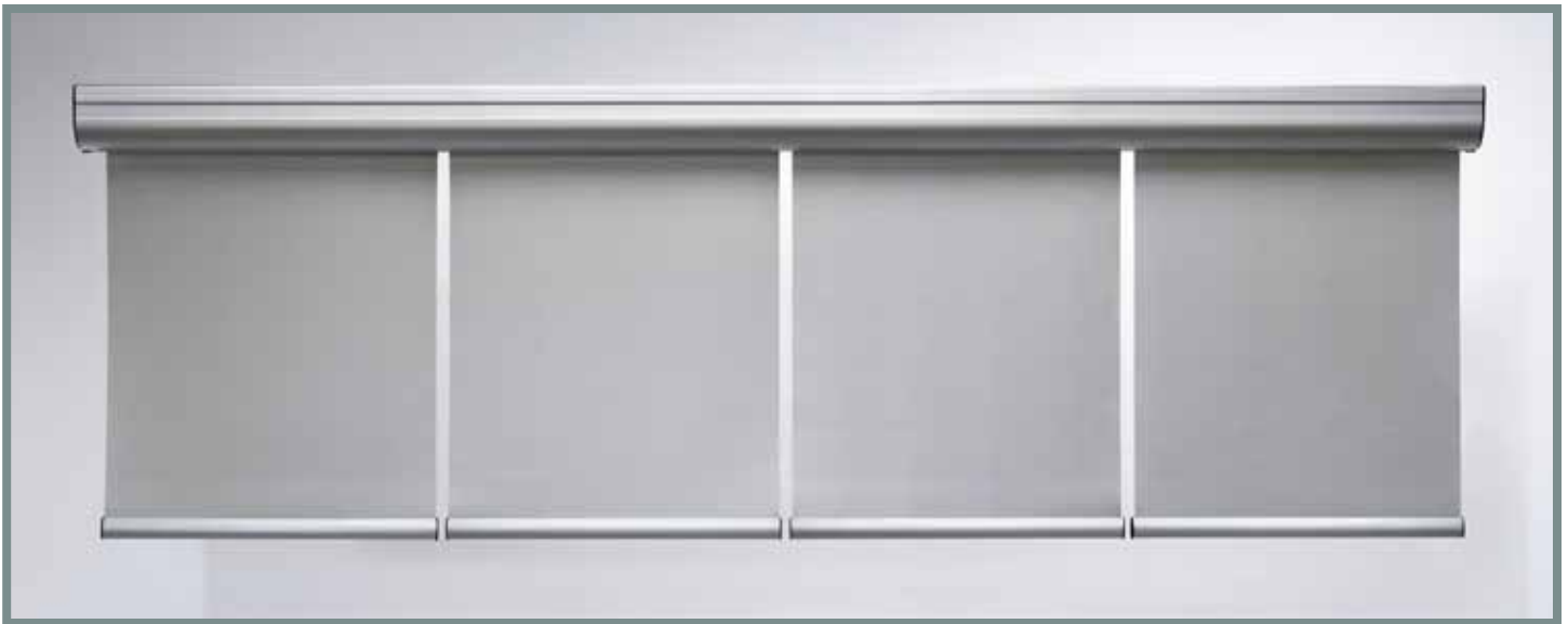
Tekno tandem. One control operates up to 4 shade bands.