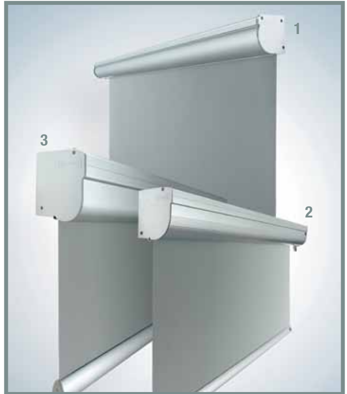
1. Tekno with Cassette 70 2. Tekno with Cassette 95 3. Tekno with Cassette 125