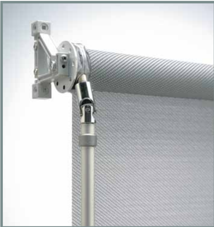
Tekno with crank operating system.