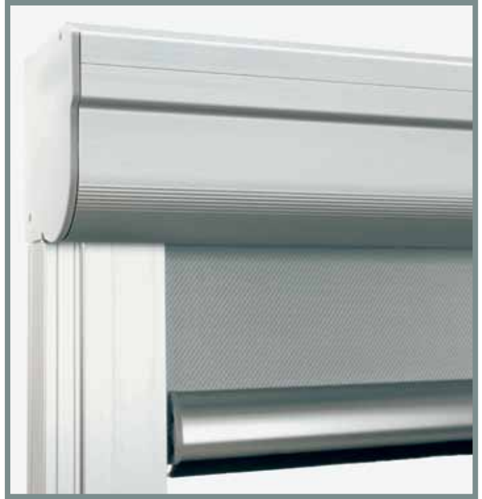
Tekno with T460-480 channels for blackout.