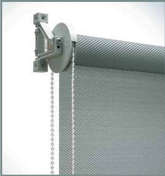
Tekno Lite-Lift chain operated system - Exclusive system with anti-breakage clutch - Control with clutch - Assistance spring with programmable pre-loading system