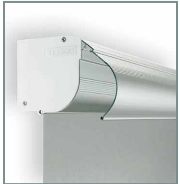
The cassette can be easily inspected for maintenance by just one person thanks to the exclusive opening system that does not detach from the frame.