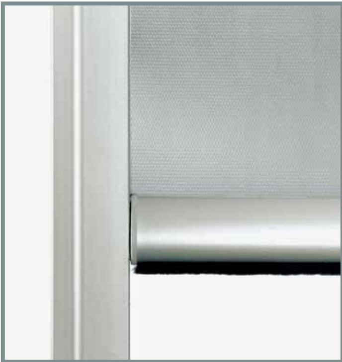
Tekno with T440. Slim line channel to be used with TK70 only.